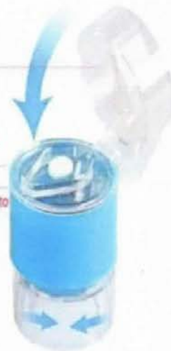
Medical pill crusher