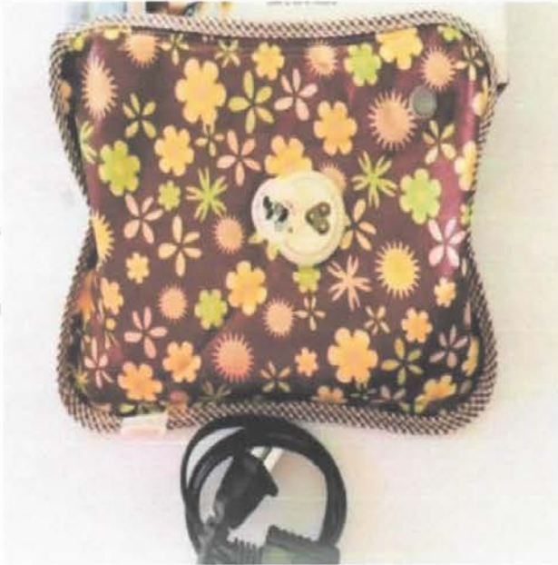
electric hot compress