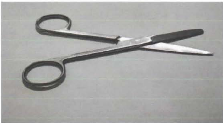
surgical straight scissors