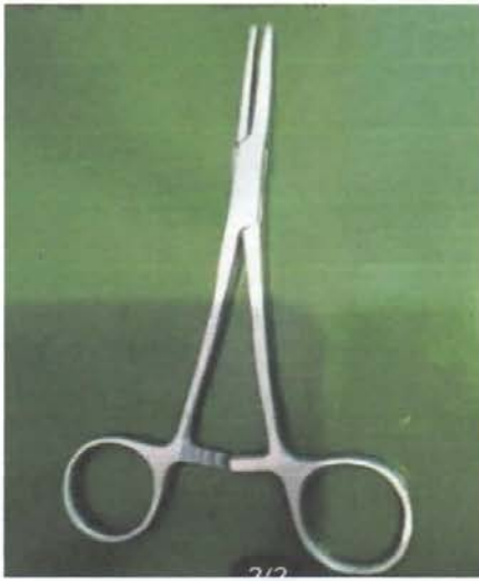
Kelly Forcep and Kelly curve forcep